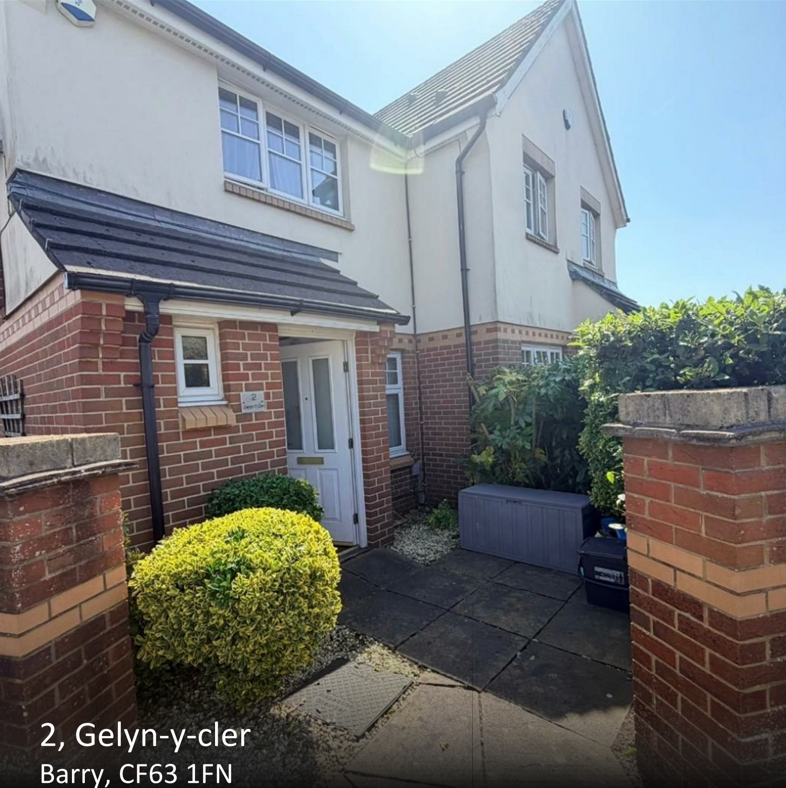
2, Gelyn-y-cler Barry, CF63 1FN